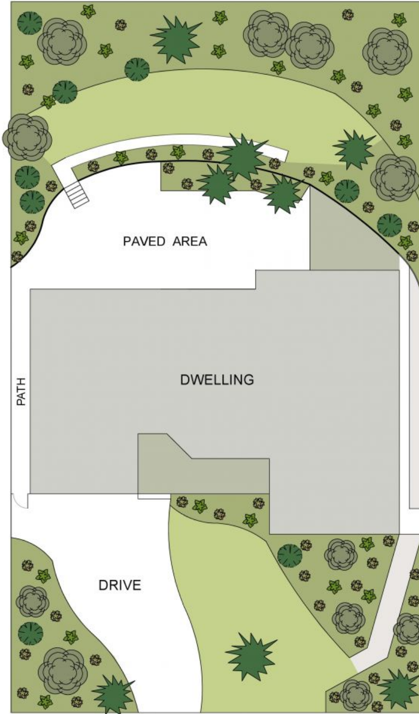
SITE PLAN (861 sq m Approx) Scale - 1:160