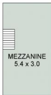
MEZZANINE OVER GARAGE (15 sq m Approx)