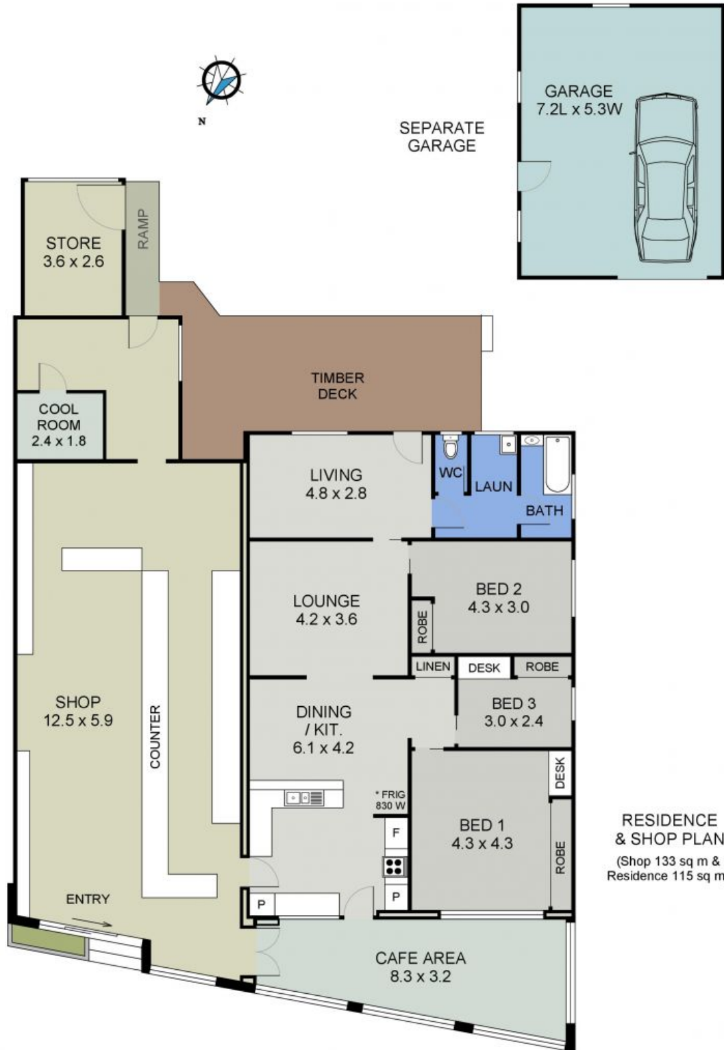
RESIDENCE & SHOP PLAN (Shop 133 sq m & Residence 115 sq m)