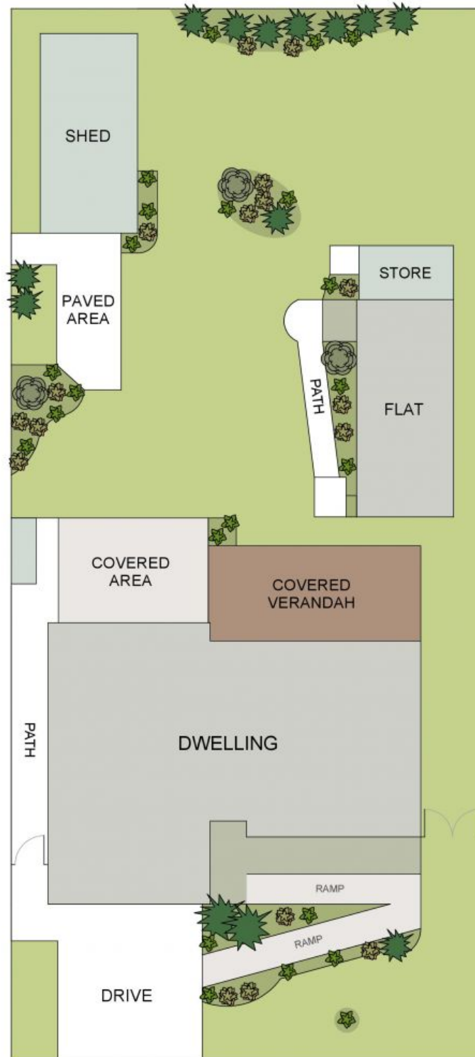
SITE PLAN (727 sq m Approx) Scale - 1:155