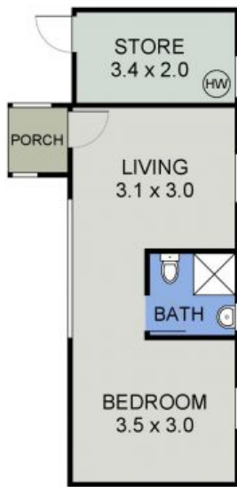
FLAT PLAN (38 sq m Approx)