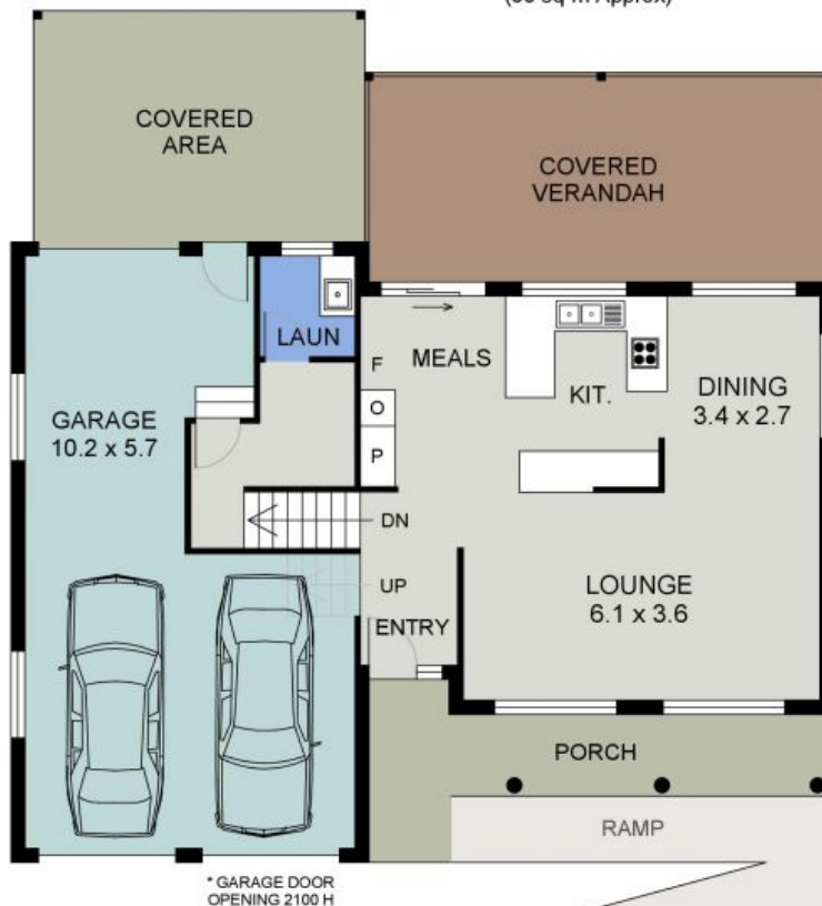
MAIN FLOOR PLAN (125 sq m Approx)