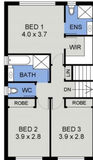
UPPER FLOOR PLAN (65 sq m Approx)