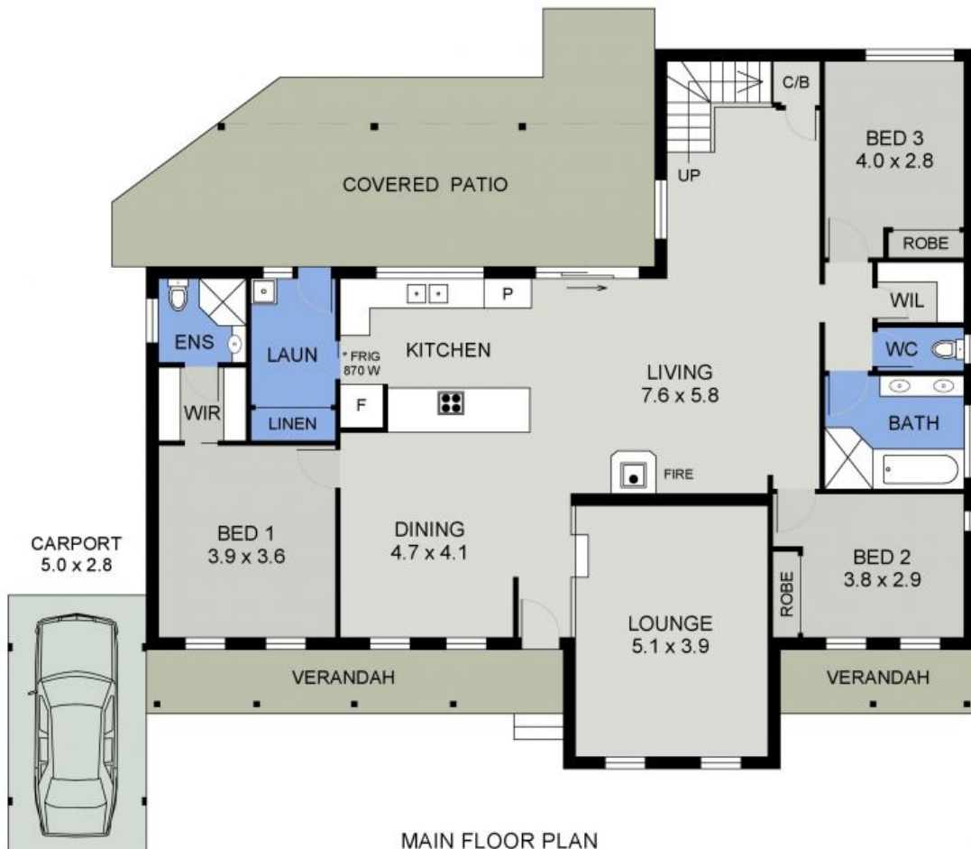
MAIN FLOOR PLAN ( 170 sq m Approx ) Scale - 1:105