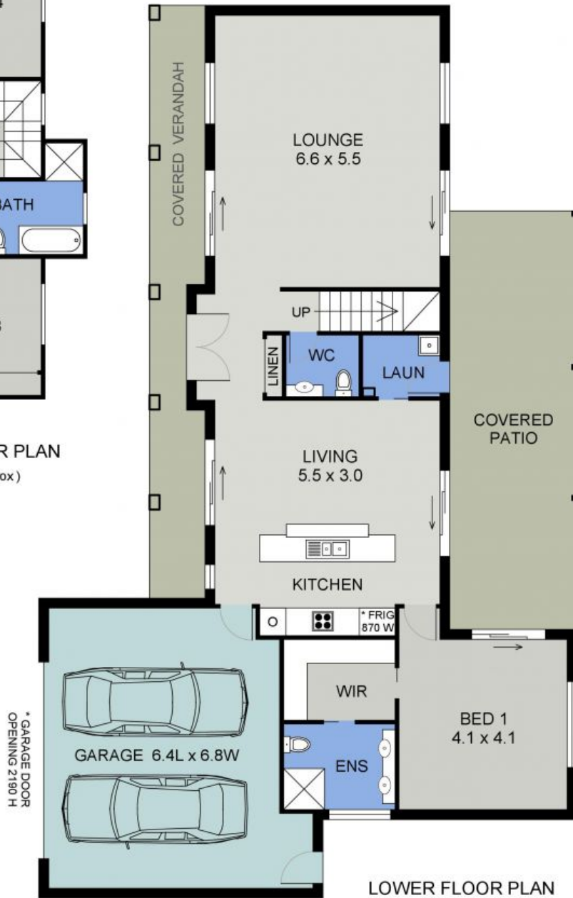
LOWER FLOOR PLAN (170 sq m Approx) Scale - 1:100