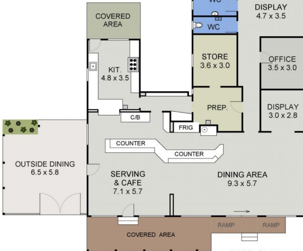
SHOP PLAN (205 sq m Approx) Scale - 1:125