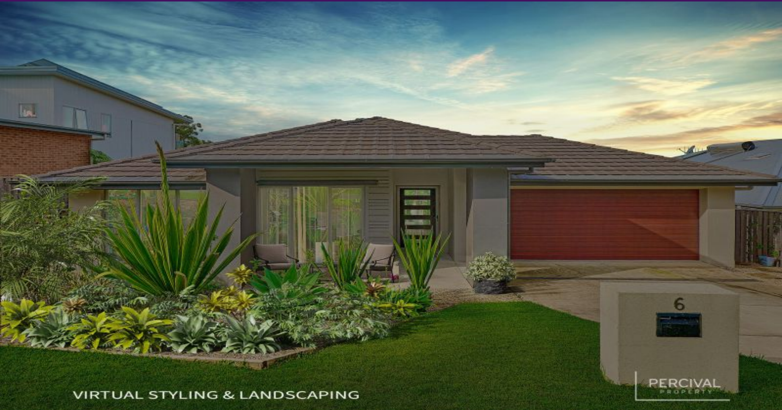
VIRTUAL STYLING & LANDSCAPING