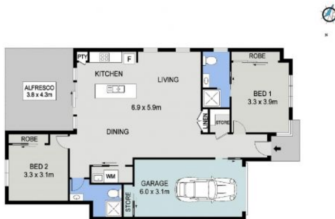
1B WHITING WAY LAKE CATHIE