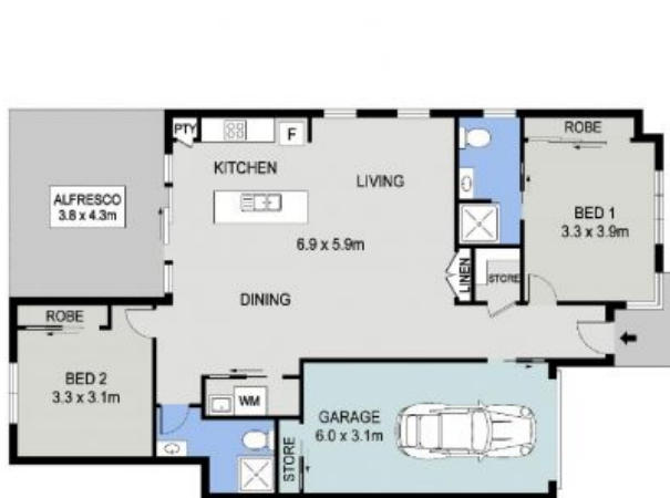
1B WHITING WAY LAKE CATHIE