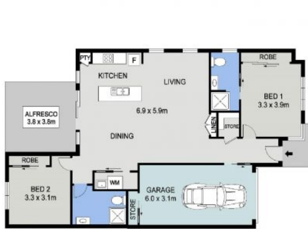
1A WHITING WAY LAKE CATHIE