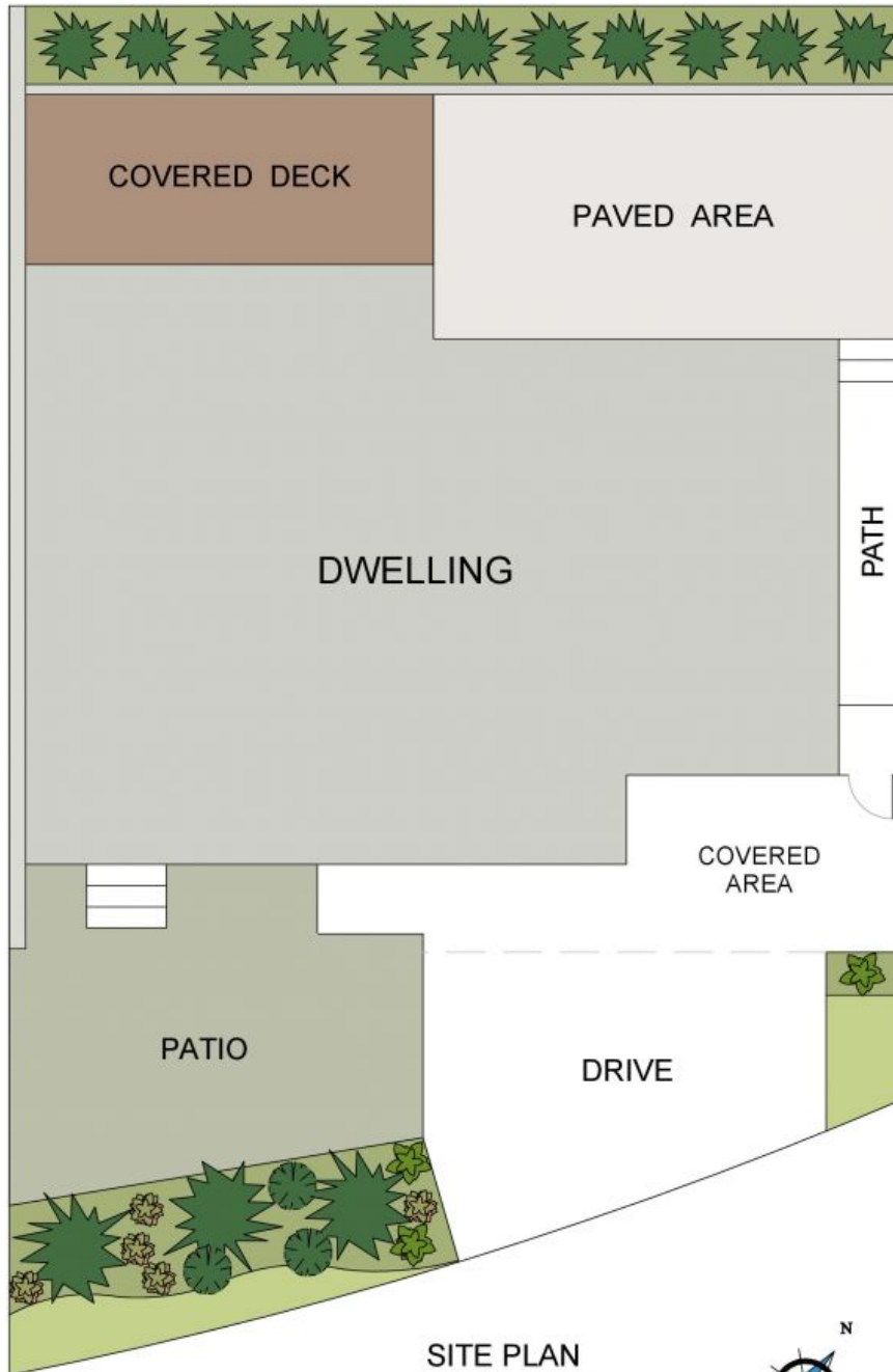
SITE PLAN (000 sq m Approx) Scale - 1:90