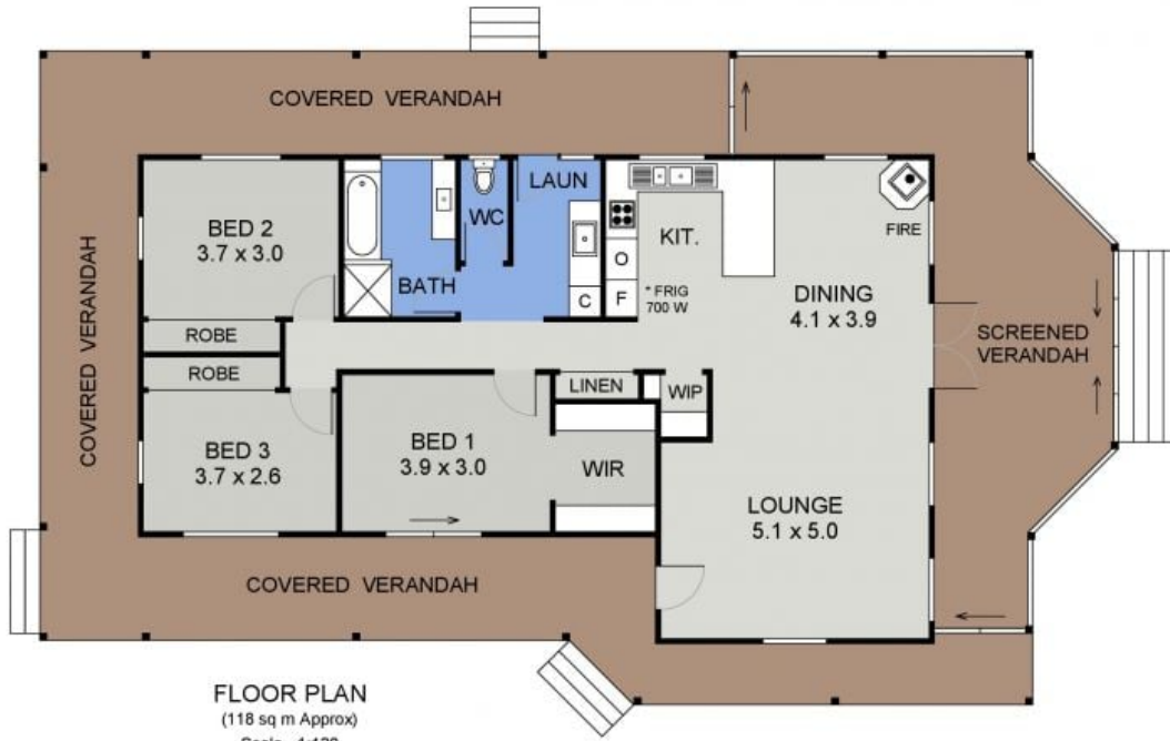
FLOOR PLAN (118 sq m Approx) Scale - 1:120