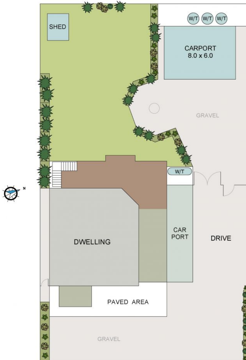
SITE PLAN (Land size - 932 sq m) Scale - 1:165