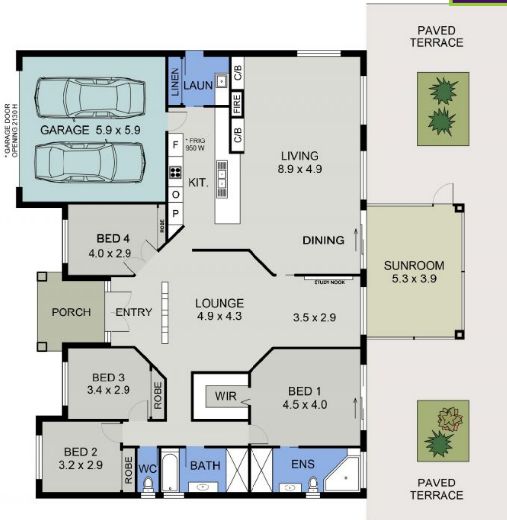
FLOOR PLAN (261 sq m Approx) Scale - 1:115