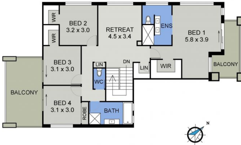
UPPER FLOOR PLAN (139.6 sq m)