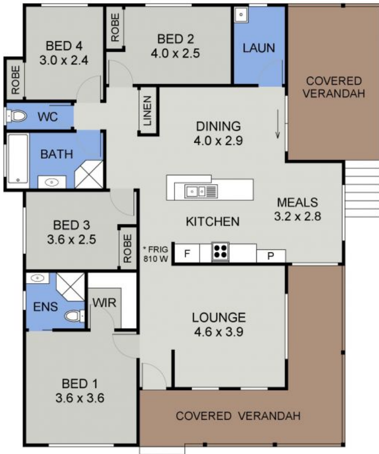
FLOOR PLAN (121 sq m Approx) Scale - 1:90