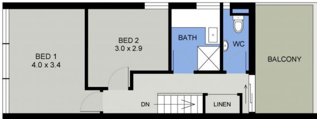
UPPER FLOOR PLAN (40 sq m Approx)