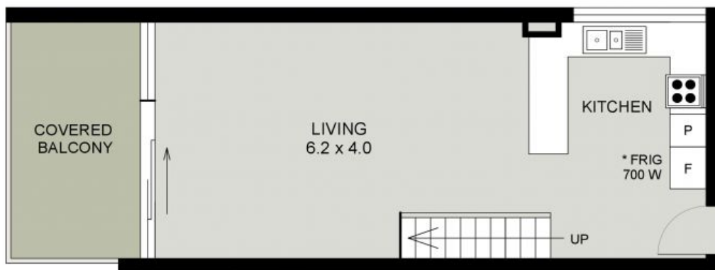
LOWER FLOOR PLAN (41 sq m Approx)