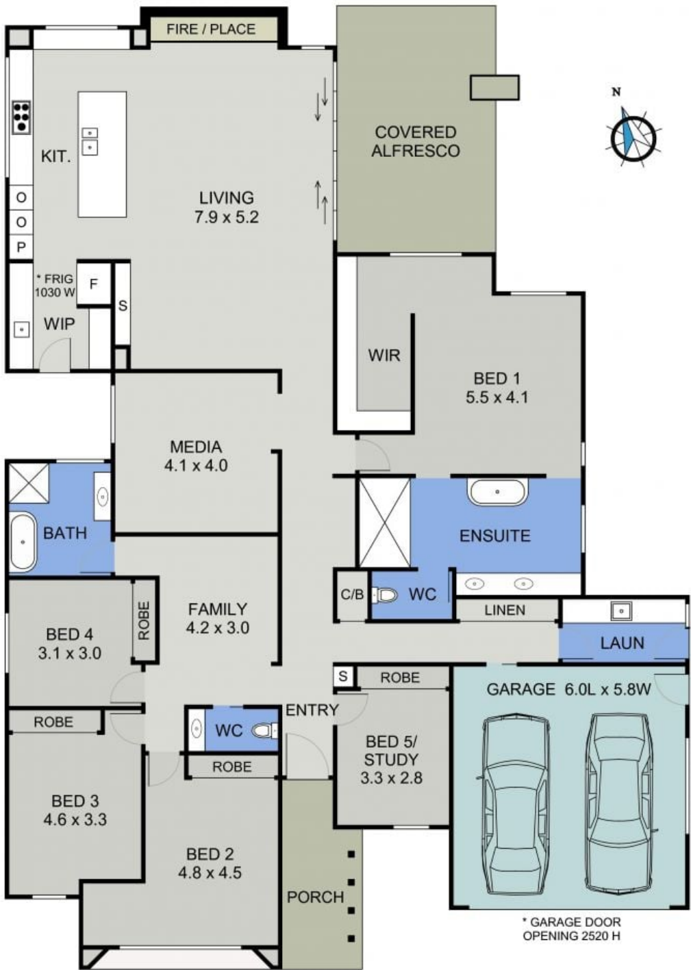
FLOOR PLAN (291 sq m Approx) Scale - 1:100