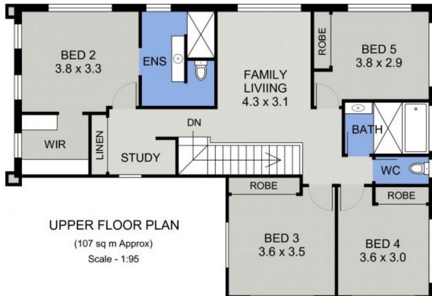
UPPER FLOOR PLAN (107 sq m Approx) Scale - 1:95