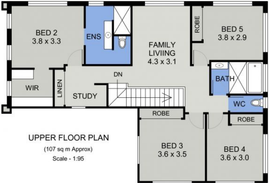
UPPER FLOOR PLAN (107 sq m Approx) Scale - 1:95