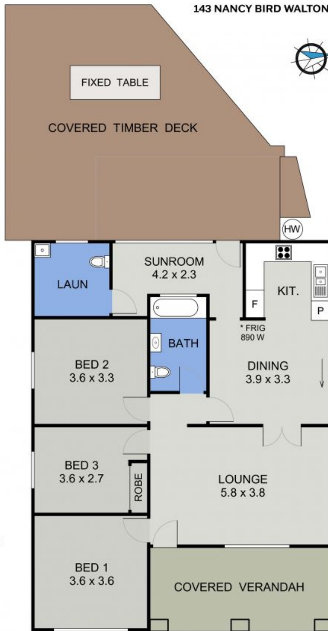
FLOOR PLAN (107 sq m Approx) Scale - 1:80

DISCLAIMER: Plans shown are for marketing purposes only. All dimensions are approximate, and may be subject to error, therefore no liability will be accepted. Interested parties should make their own enquiries.