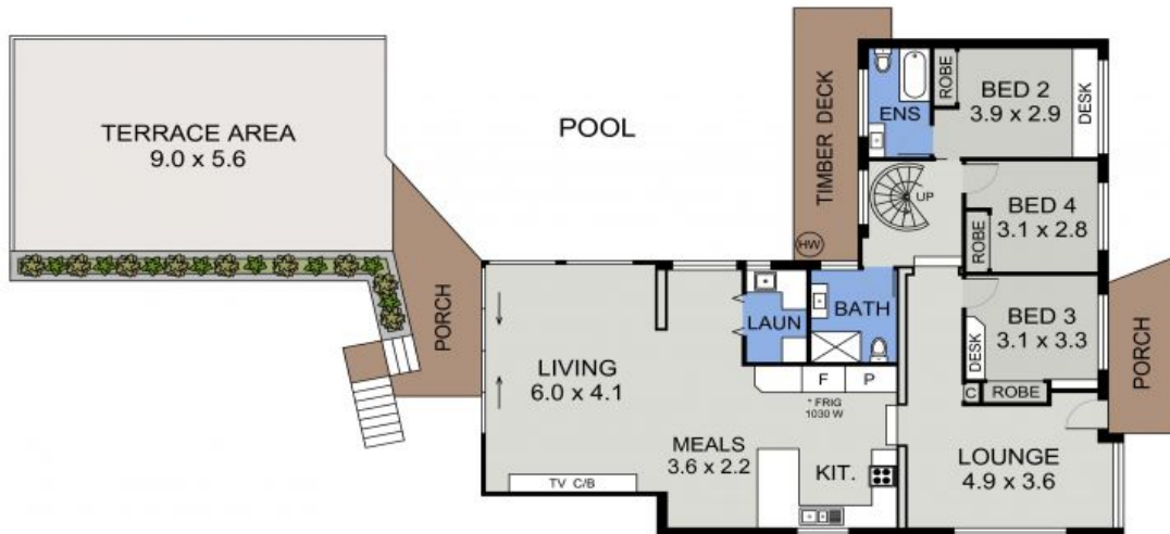
LOWER FLOOR PLAN (142 sq m Approx)