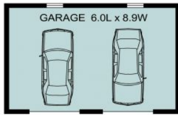
SEPARATE GARAGE BELOW TERRACE