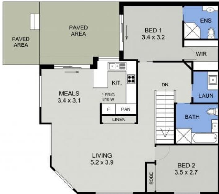
UPPER FLOOR PLAN (93 sq m Approx)