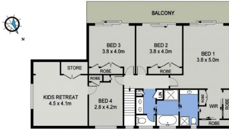
UPPER PLAN (121 sq m Approx)