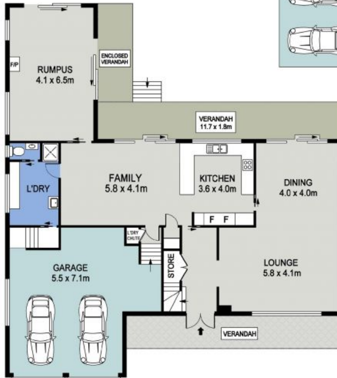
LOWER FLOOR (196 sq m Approx)