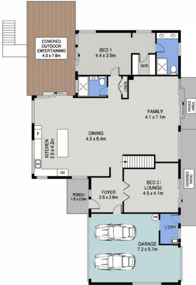
LOWER PLAN (219 sq m Approx)