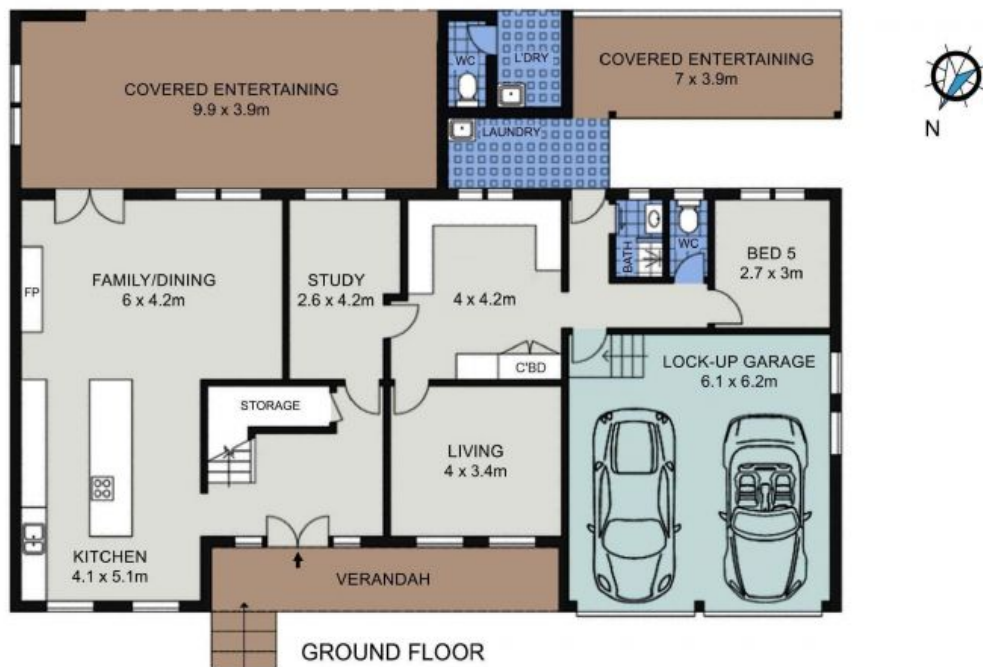
FLOOR PLAN 266sqm internal (approx.)