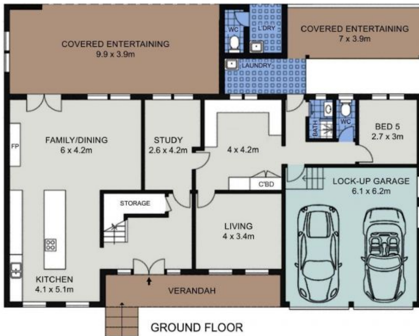
FLOOR PLAN 266sqm internal (approx.)