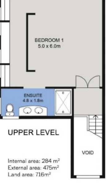
15 PARIS LANE PORT MACQUARIE