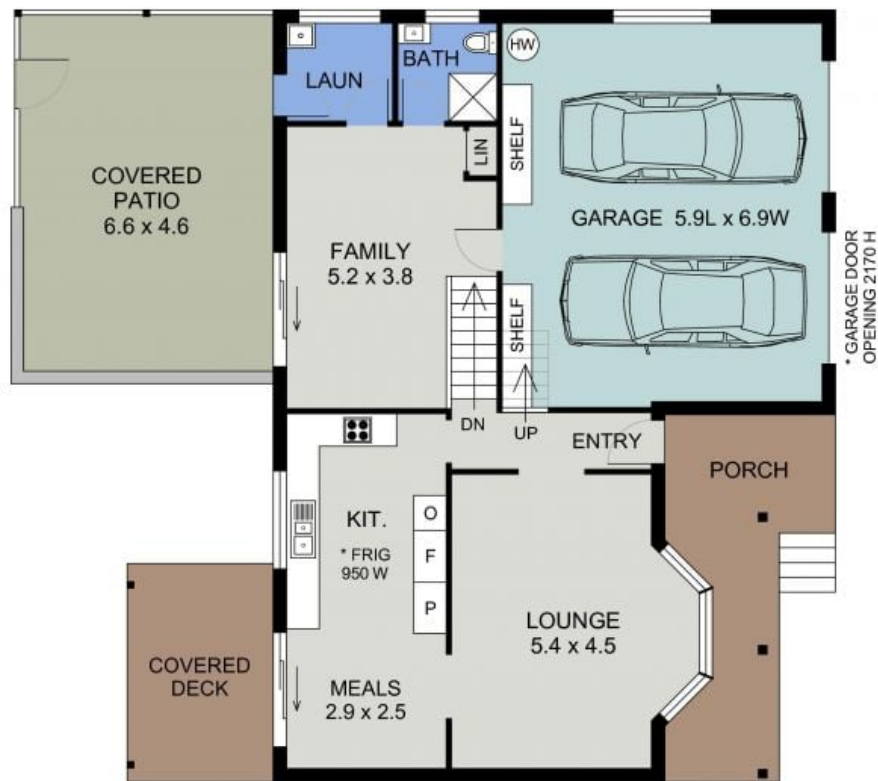
LOWER FLOOR PLAN (128 sq m Approx) Scale - 1:95