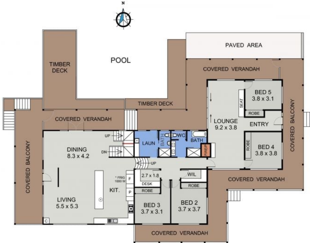
MAIN FLOOR PLAN (248 sq m Approx)