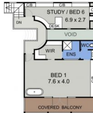
UPPER FLOOR PLAN (75 sq m Approx) Scale - 1:175