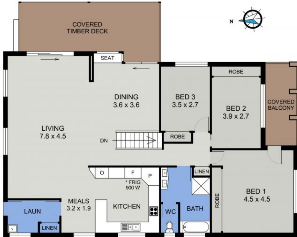
UPPER FLOOR PLAN (152 sq m Approx)