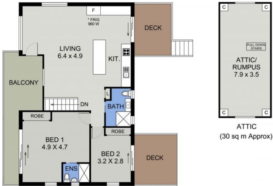
UPPER FLOOR PLAN (96 sq m Approx)