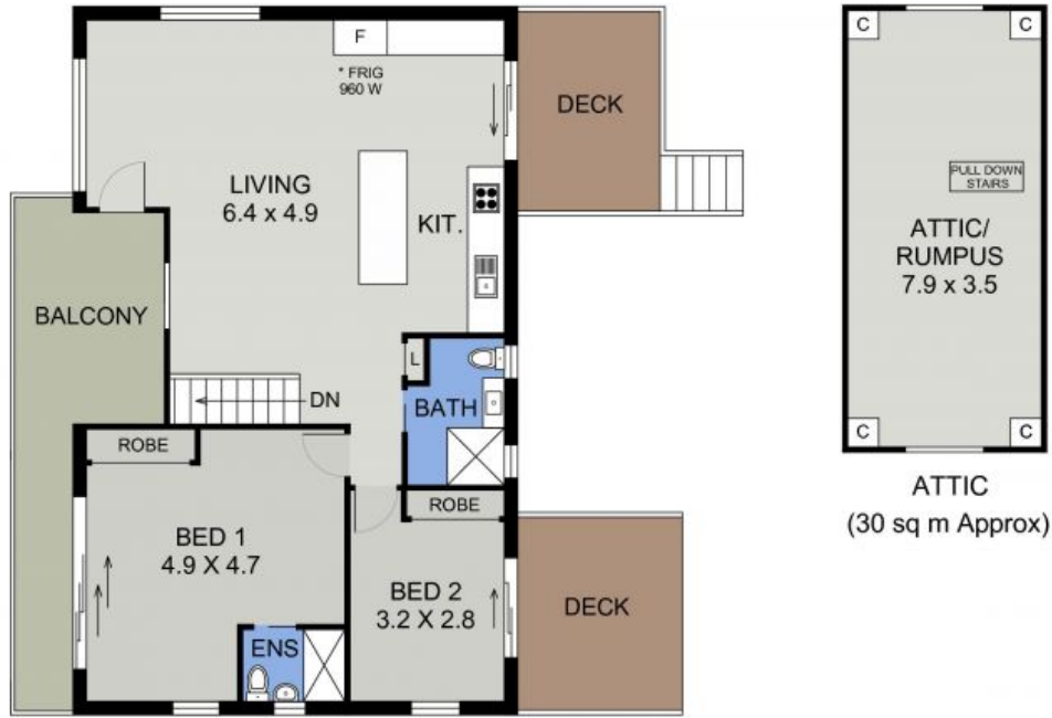
UPPER FLOOR PLAN (96 sq m Approx)