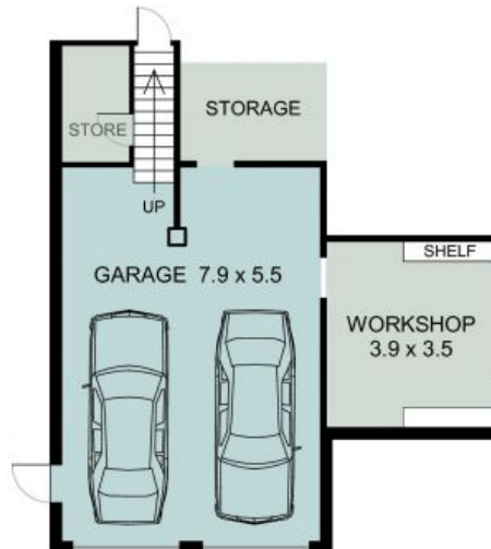
LOWER FLOOR PLAN (64 sq m Approx)