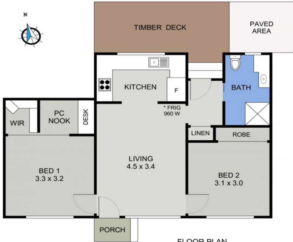
FLOOR PLAN (61 sq m Approx) Scale - 1:65