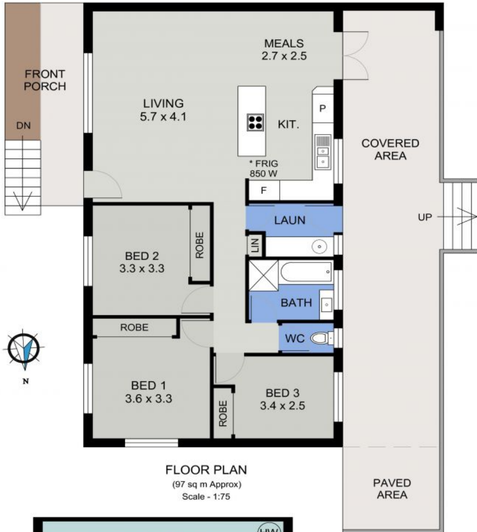
FLOOR PLAN (97 sq m Approx) Scale - 1:75