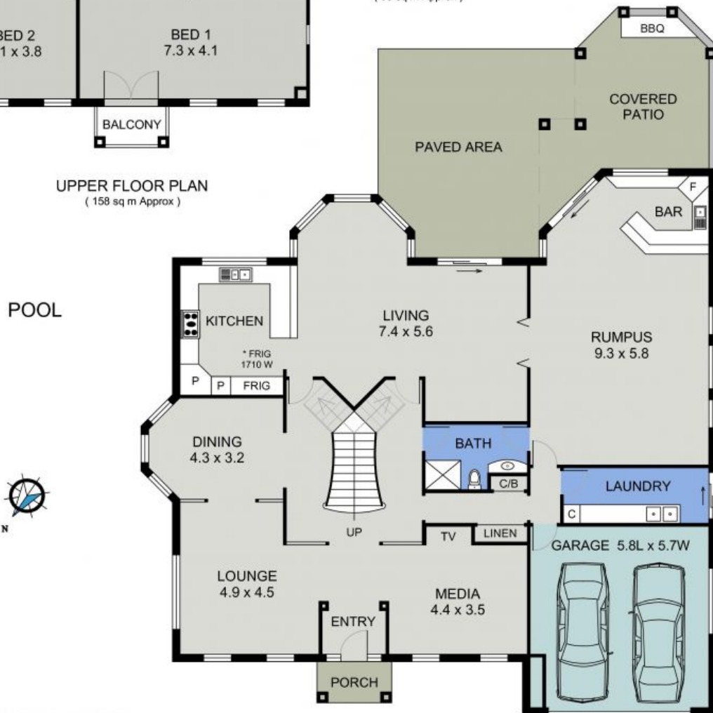
19 ELKHORN GROVE PORT MACQUARIE