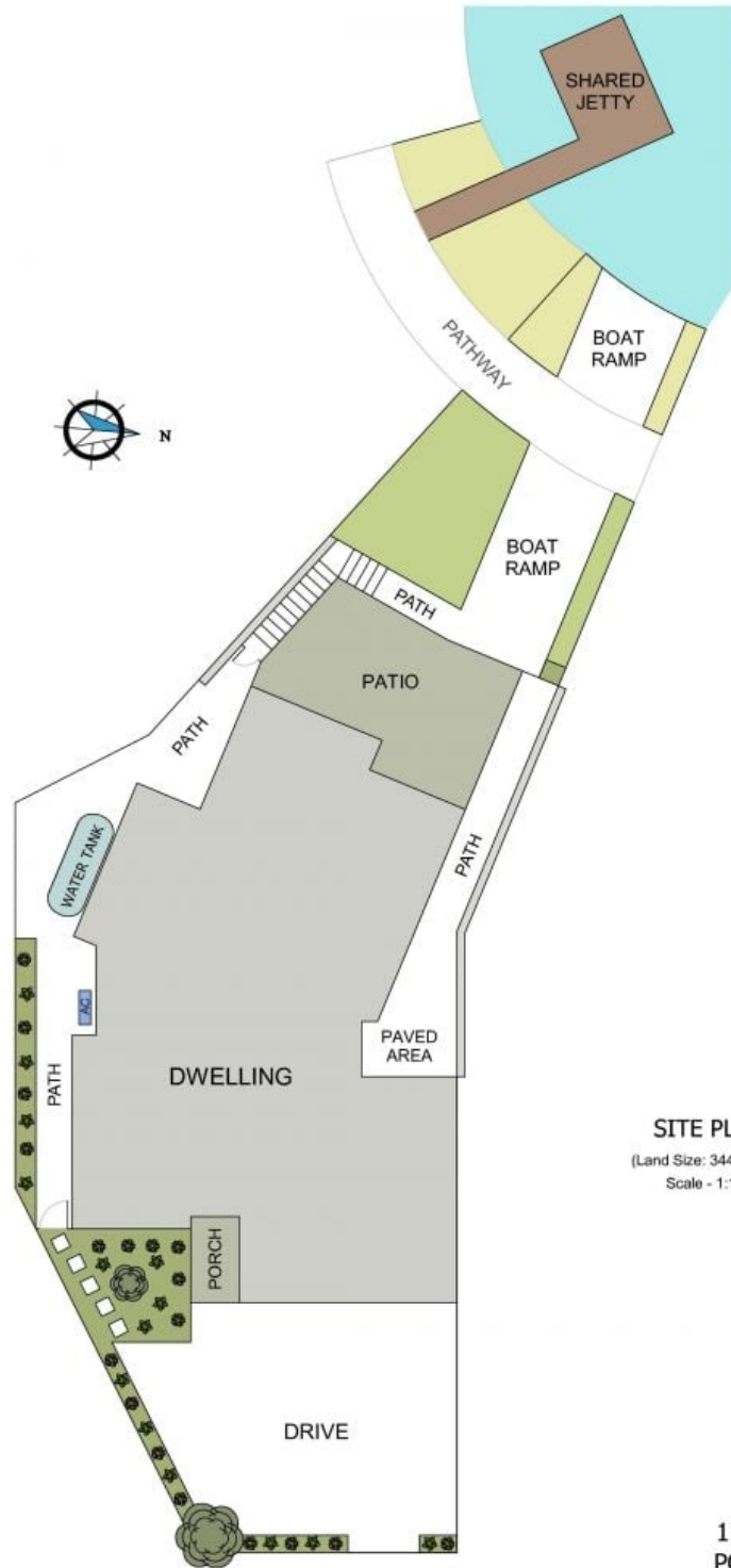
SITE PLAN (Land Size: 344.8 sq m) Scale - 1:160