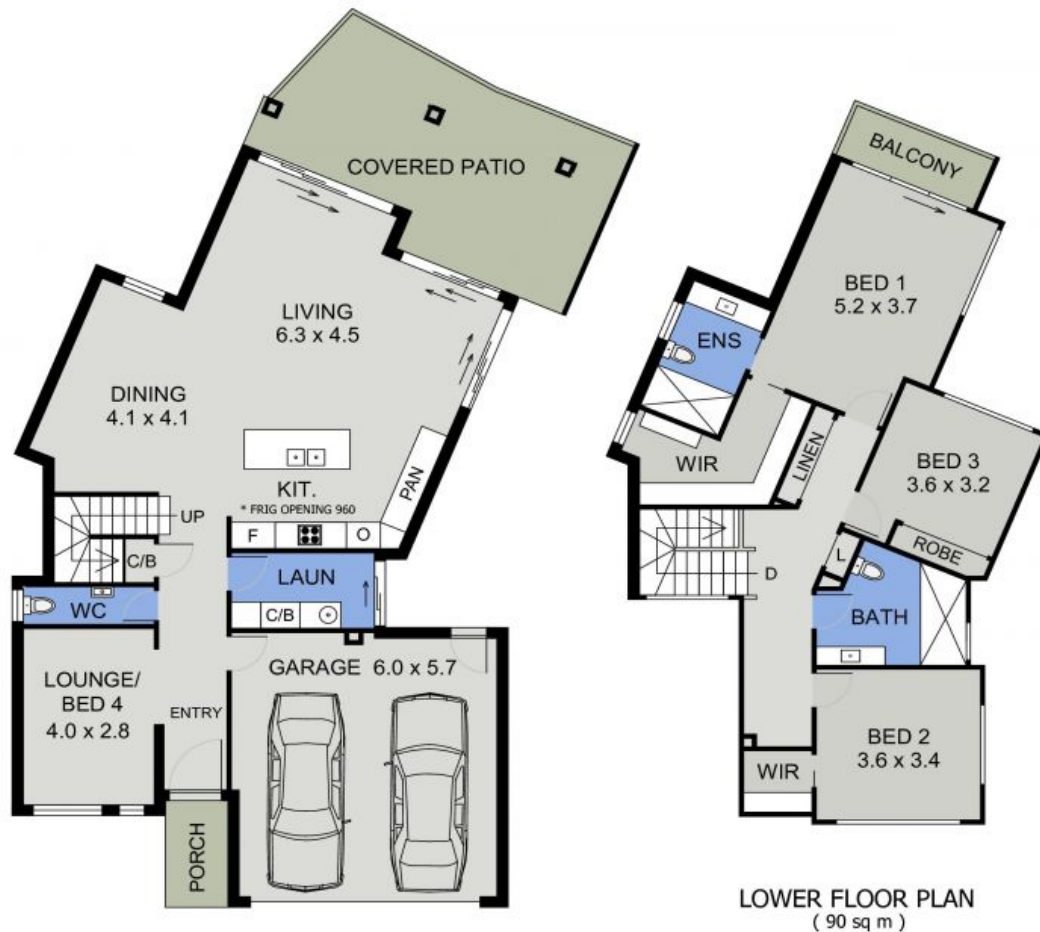
MAIN FLOOR PLAN ( 138 sq m )