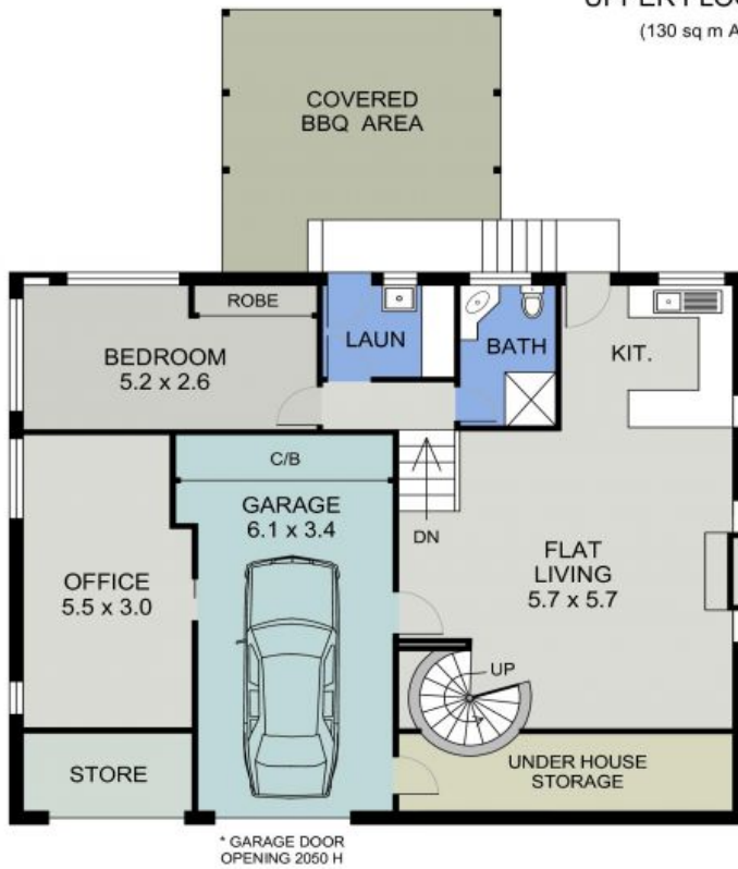
LOWER FLOOR PLAN (123 sq m Approx) Scale - 1:105