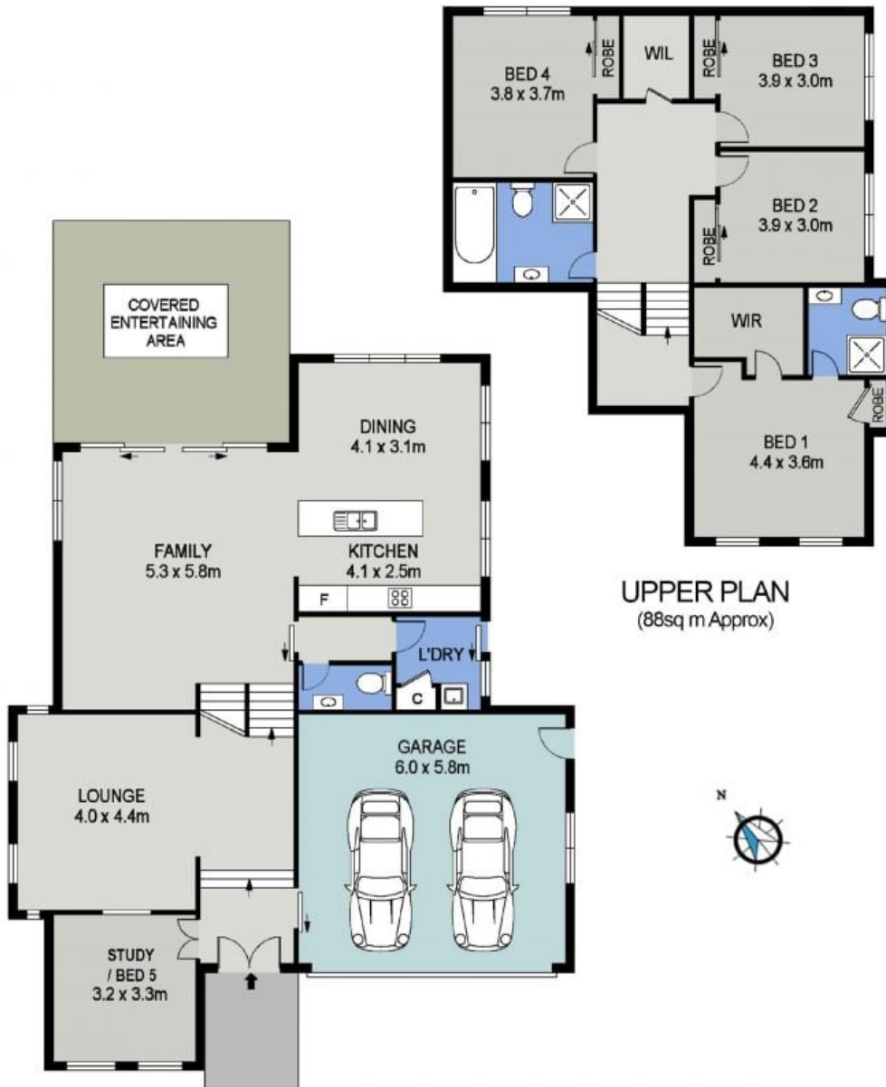
LOWER PLAN (140 sq m Approx)