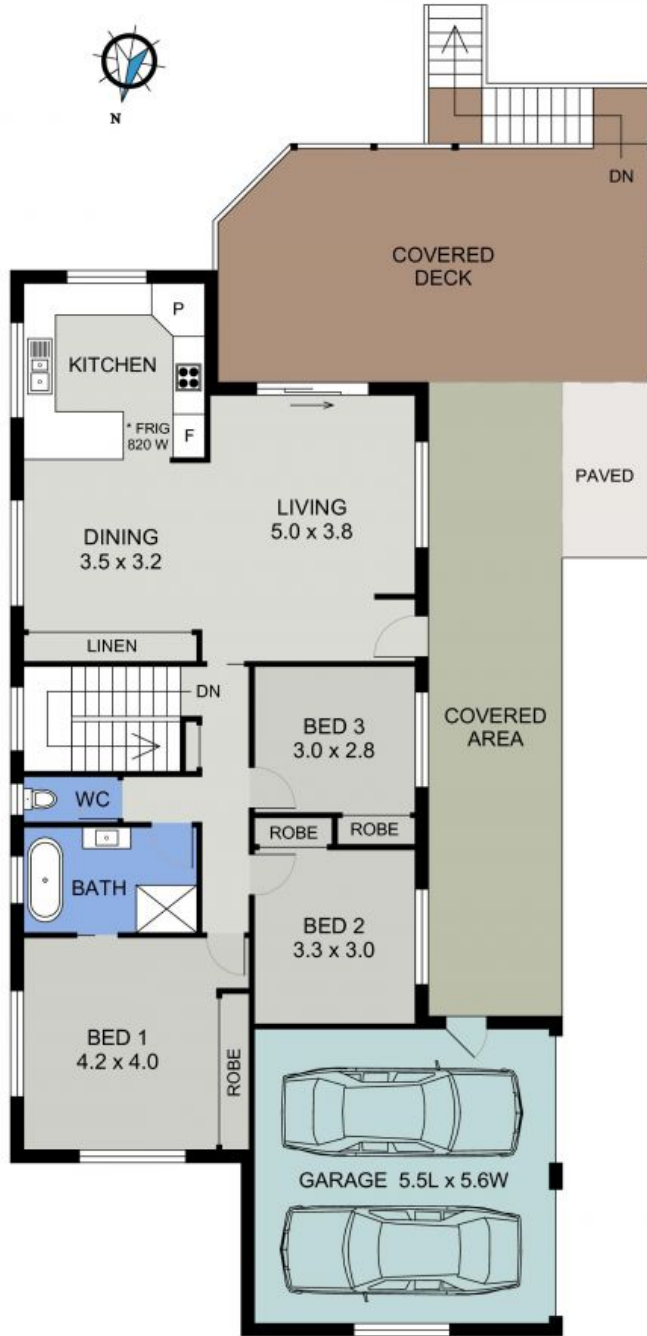
MAIN FLOOR PLAN (150 sq m Approx)