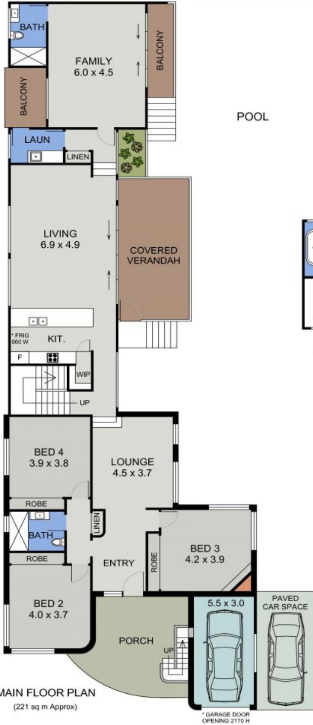
MAIN FLOOR PLAN (221 sq m Approx)