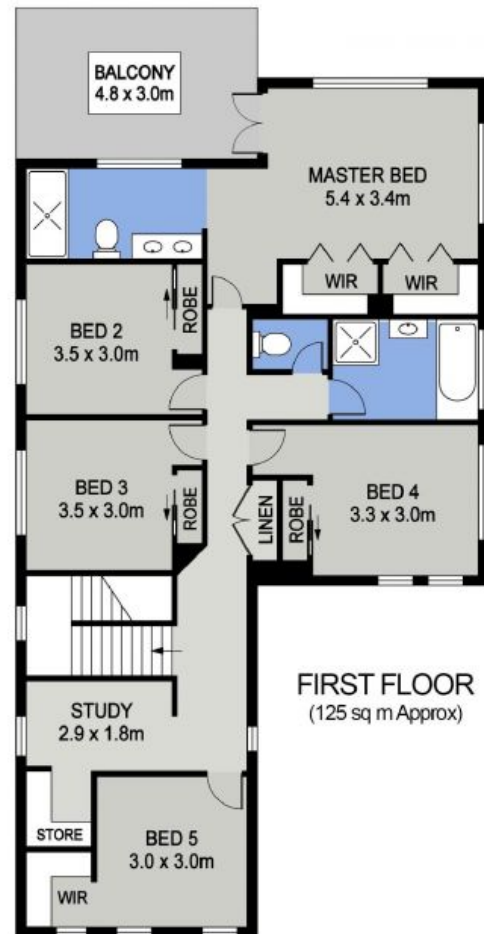
FIRST FLOOR (125 sq m Approx)