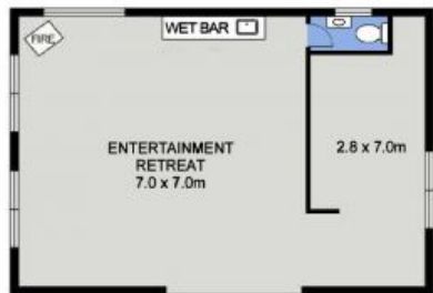
RETREAT (70sq m Approx)