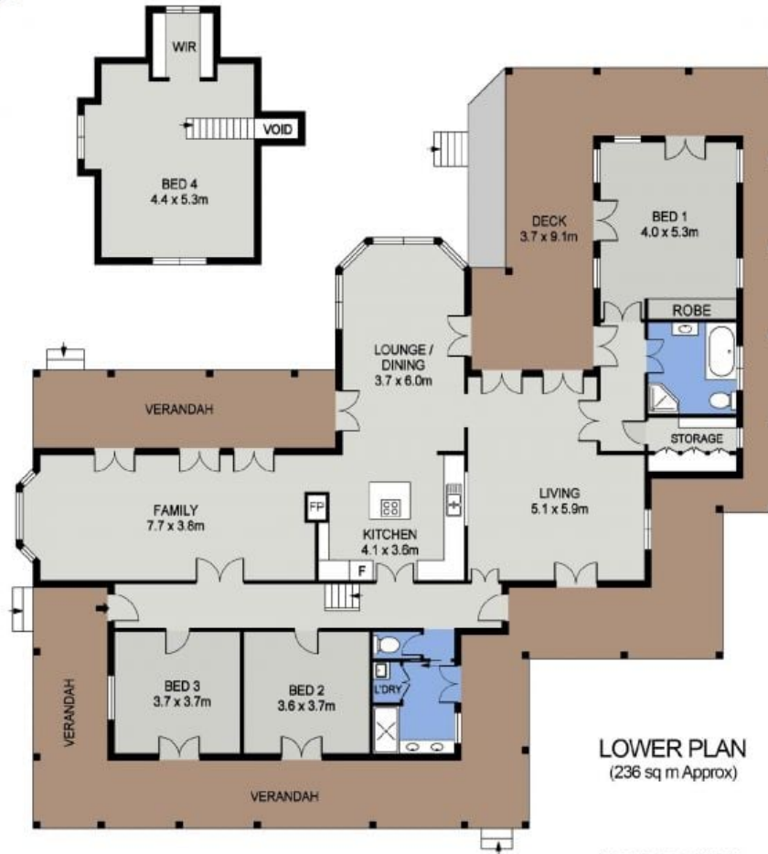
LOWER PLAN (236 sq m Approx)