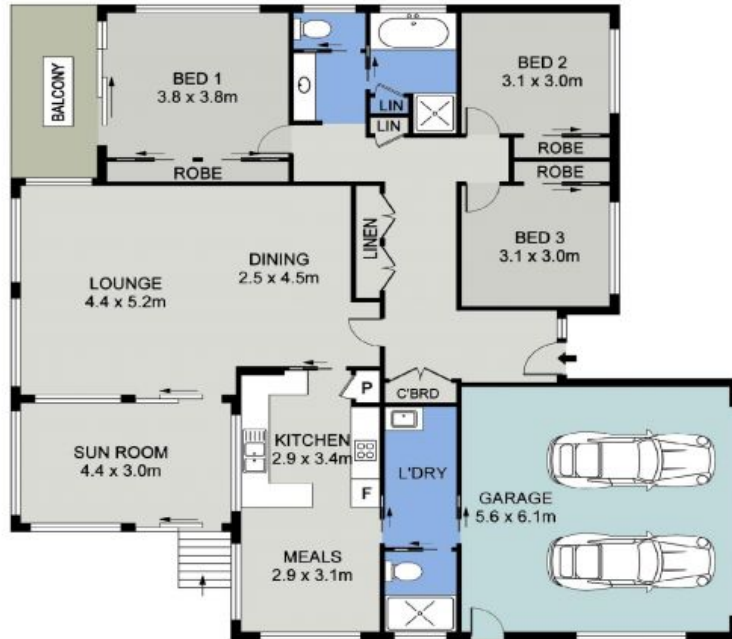
UPPER PLAN (188 sq m Approx)